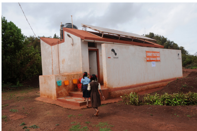
Community Toilet Block at Kammathuru Village