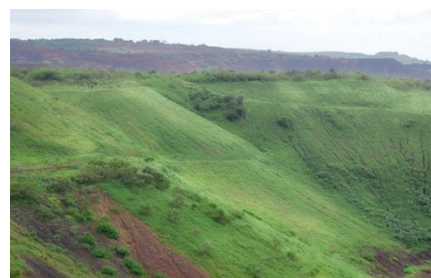
Coir Mat on Waste Dump

and respect to the various statutes and rules, has held the Company in good stead. The Government of India had appointed a committee, popularly known as Vasudeva Committee to study Manganese Ore Mining Procedures in India. The Report of the Committee, published in 1965, significantly noted: “Although in the case of a large number of mines, the mining operations do not follow any concerted or well thought out plan of development, there are a few bright exceptions such as mines controlled by Manganese Ore India Limited, M/s. Sandur Manganese and Iron Ores Limited and a few other companies who have planned the lay-out of their mines in a systematic manner.”