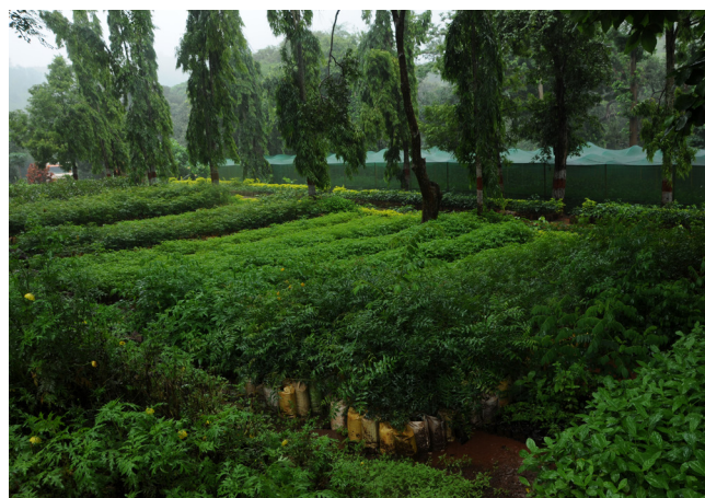
Nursery at Mines

Yes. The Company recognizes the need to address the global environmental issues such as climate change, global warming, etc., and endeavours to contribute its utmost to reduce climate change and global warming. Against the statutory requirement to plant 1.11 lakh trees as stipulated under the SEMP, the Company has planted more than 35 lakh saplings with about 70% survival within its mining leases. Also, as against a requirement of 34 Ha of green belt creation as stipulated in the Environmental Clearance for 1 mtpa steel plant, the Company has decided to create 11 ha of additional green belt. These initiatives can be viewed at https://www.sandurgroup.com/SDF.html .