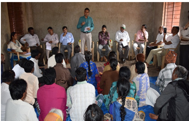
Consultation with Kammathuru villagers at Community Hall after adoption of Kammathuru village

Dedicated community liaison teams maintain regular and open dialogue with stakeholders, particularly local communities and undertake various community-related initiatives including preferential employment of local people, training and skill-development of locals, promoting and assisting local small businesses and self-help activities.