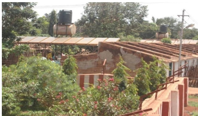
Solar water heater system at Deogiri Housing Colony

With a focus to completely eliminate utilisation of thermal coal for power generation for ferro alloys production, the Company has set-up Waste Heat Recovery Boilers and is in the process of commissioning and producing power using waste heat from Coke Oven plant. The Waste Heat Recovery Boiler, which is a co-generation plant as classified by the Government of Karnataka, has potential to generate about 212 mu per annum. Between 20 February 2020 until 26 March 2020, about 9.2 million units (mu) of energy was generated from the flue gases through the WHRB. Further details can be viewed at https://www.sandurgroup.com/SDF.html .