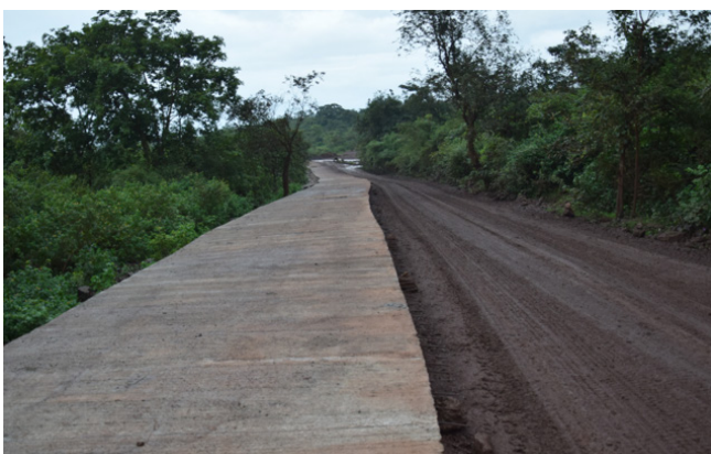
New CC road from SK Temple to Deogiri work under progress

Based on one such stakeholders consultation, the Company has, in the interest of public, undertaken construction of 35 kilometres of external roads at a cost of ₹ 85 crore to mitigate the impact of dust due to transportation of ores through trucks. The cost of construction of these external roads is being shared by other mining lessees and customers in the region.