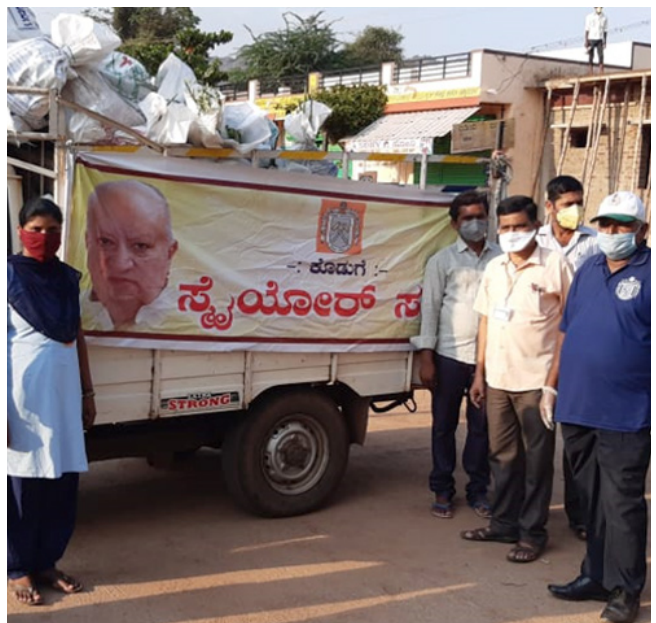
Vegetable distribution during COVID-19 at Krishna Nagar, Sandur

Though mining and integrated steel plant related operations come under essential services and goods, and are allowed to continue its operations, around end March 2020, the Company was forced to stop its mining operations, ferroalloy plant, power plant, and reduced its Coke Oven operation to bare minimum 30% capacity in the larger interest of safety of its employees and to ensure prevention of spread of COVID-19. Decision to stop Plant