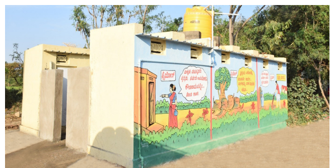
Community Toilet Block at Ayyanahalli with Awareness Painting

During the last 3 years (FY 2018, 19 & 20), SMIORE has spent ₹23.4 crore on 90 activities under CER, including construction of 2084 individual toilets. This is in addition to construction of 1000 toilets under the CSR program of SMIORE, thereby achieving a total of over 3000 individual toilets.