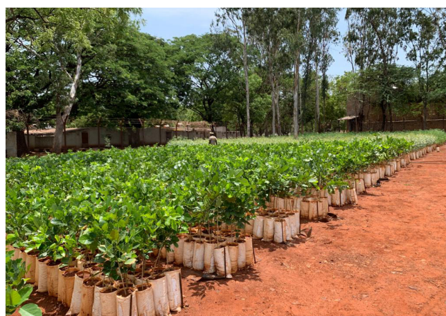
Nursery at MFA Plant

Yes, the Company has defined methods of identifying and assessing potential environmental risks. It carries out Environmental Impact Assessment of operations/ activities to identify impacts on the surrounding environment and initiate mitigation measures accordingly.