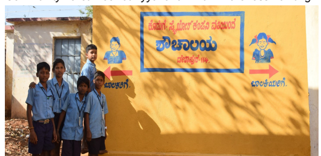
Danapura – Toilet Block at Government School