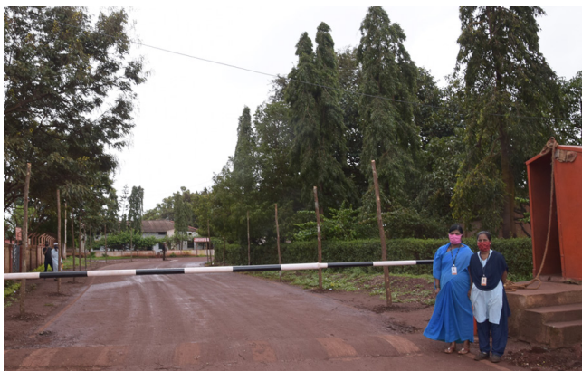
Lady Security Guards