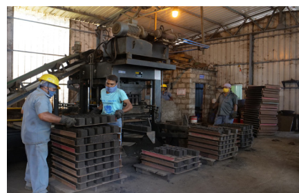
Fly-ash brick unit

The Company's water management plan includes rainwater harvesting, a water target to improve the efficiency and recycling of used water from the kitchens, bathrooms and laundry, and a water risk review to assess risks and opportunities associated with biodiversity. Recycled water (including from Sewage Treatment Plant) is used for dust suppression caused by vehicular traffic.