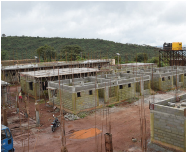
Construction of New Housing Colony at S. B. Halli under progress

The Company is building 192 quarters for its workers at Deogiri and Subbarayana Halli replacing the existing quarters which are more than 6 decades old. In view of the present situation, the Company is experiencing shortage of labour and accordingly, construction of these quarters is expected to be completed by 31 March 2021.