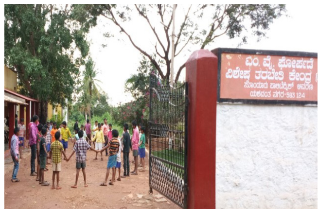
MYGSTC at Yeshwanthnagar