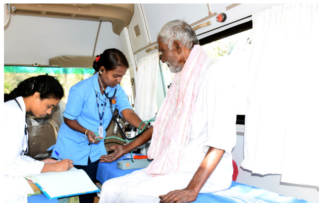
Rural Health Camps by Arogya