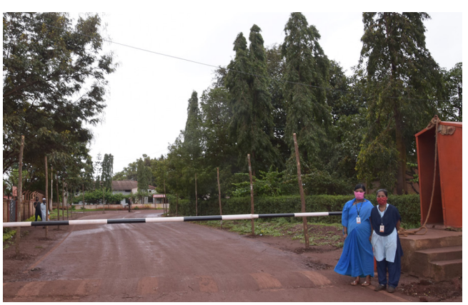
Lady Security Guards