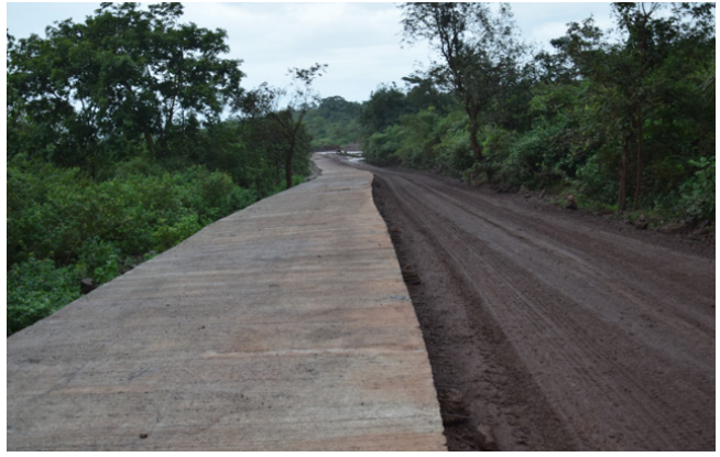
New CC road from SK Temple to Deogiri work under progress

Based on one such stakeholders consultation, the Company has, in the interest of public, undertaken construction of 35 kilometres of external roads at a cost of ₹85 crore to mitigate the impact of dust due to transportation of ores through trucks. The cost of construction of these external roads is being shared by other mining lessees and customers in the region.