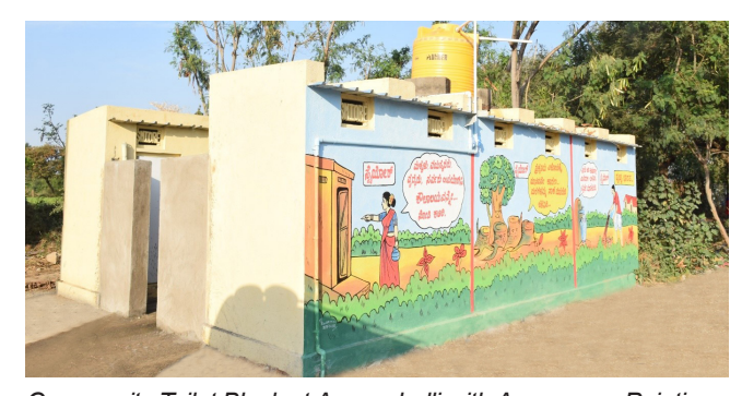
Community Toilet Block at Ayyanahalli with Awareness Painting

During the last 3 years (FY 2018, 19 & 20), SMIORE has spent ₹23.4 crore on 90 activities under CER, including construction of 2084 individual toilets. This is in addition to construction of 1000 toilets under the CSR program of SMIORE, thereby achieving a total of over 3000 individual toilets.