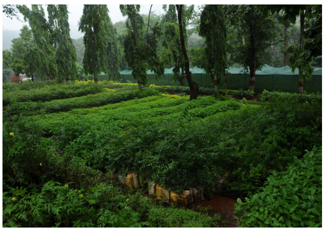
Nursery at Mines

Yes. The Company recognizes the need to address the global environmental issues such as climate change, global warming, etc., and endevours to contribute its utmost to reduce climate change and global warming. Against the statutory requirement to plant 1.11 lakh trees as stipulated under the SEMP, the Company has planted more than 35 lakh saplings with about 70% survival within its mining leases. Also, as against a requirement of 34 Ha of green belt creation as stipulated in the Environmental Clearance for 1 mtpa steel plant, the Company has decided to create 11 ha of additional green belt. These initiatives can be viewed at https://www.sandurgroup.com/SDF.html.